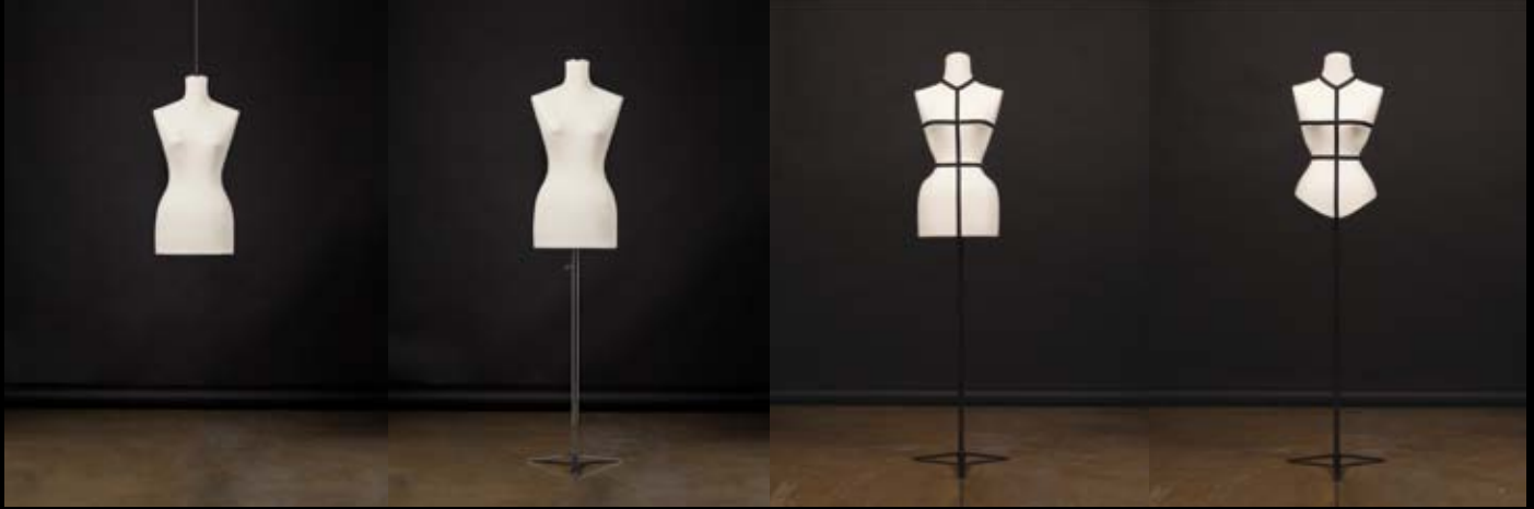
LR 1503 extra