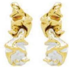
Marni Resort 19