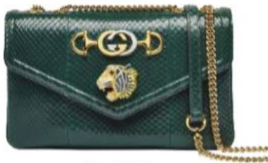
Gucci SS 19