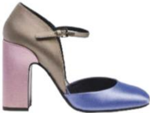
Fabrizio Viti SS 19