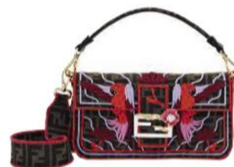
Fendi SS 19