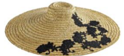
Montegallo SS 19