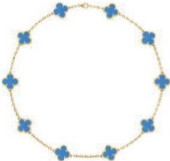
Van Cleef & Arpels