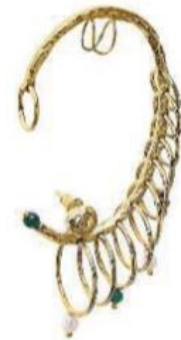
Attico SS 19