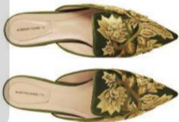
Alberta Ferretti Resort 19