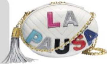
Chanel Cruise 19