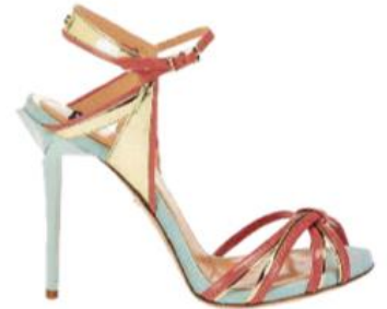
Elisabetta Franchi SS 19