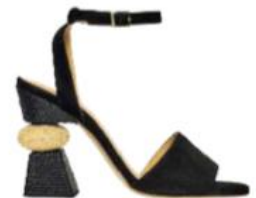
Paloma Barceló SS 19