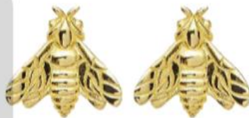
LTC Lorella Tamberi Canal