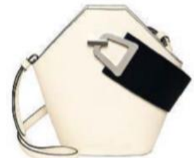
Danse Lente Resort 19

Giacca tramata in misto lino e pantaloni di misto seta. Scarpe. Tutto Giorgio Armani Resort 19. Copricapo modellabile. Flapper. Manichino. La Rosa. Make-up realizzato con Cristalli Swarovski. Woven jacket in a linen blend and trousers in a silk blend. Shoes. All Giorgio Armani Resort 19. Hat that can take different shapes. Flapper. Mannequin. La Rosa. Make-up done with Cristalli Swarovski.