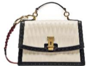
Bally SS 19