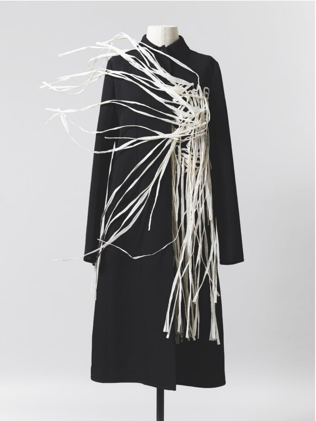
This page, jacket, £1,250, by Jil Sander . Opposite, brooch, £690, by Louis Vuitton