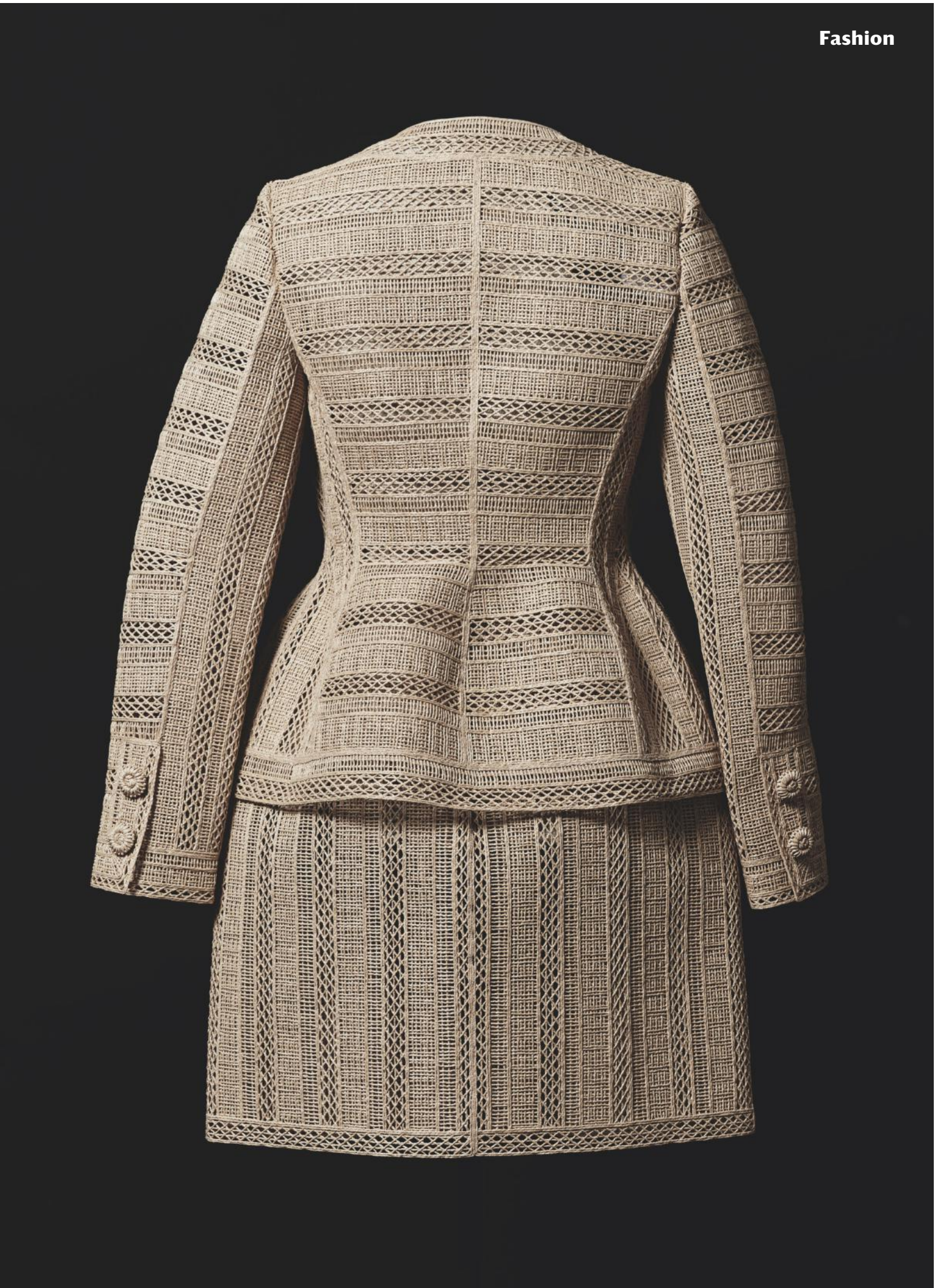
This page, top, £2,090, by Bottega Veneta . Jacket, £575, by Boss . Opposite, jacket, €5,450; skirt, €2,250, both by Dolce & Gabbana For stockists, see page 184