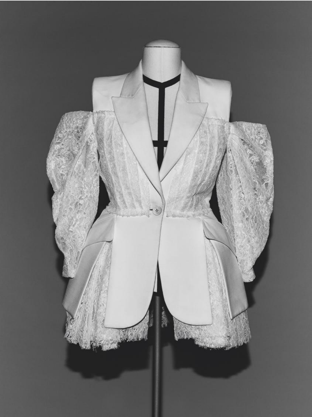
This page, jacket, £5,340, by Alexander McQueen . Opposite, boots, £2,400, by Celine